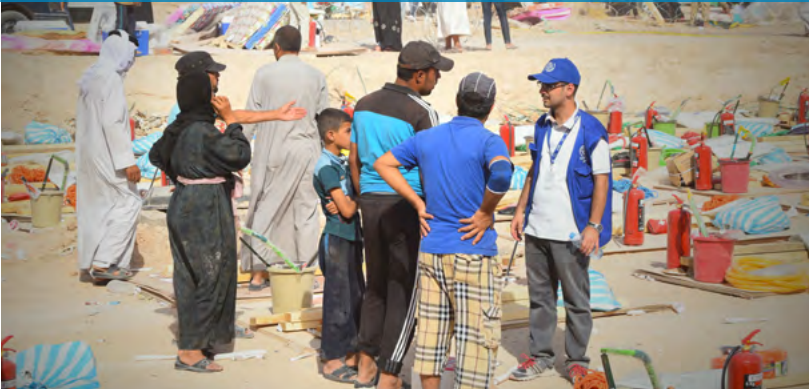
Sealing-off kits distribution in Tikrit, Salah al-Din governorate | August 2016