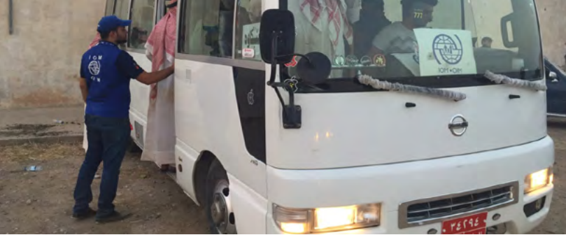
Transportation of IDPs from Al Khazir to Dibaga Camp in Makhmor district | August 2016

The kits include building supplies, plastic sheeting and plywood to reinforce shelters. The kits are provided with the support of the European Union Humanitarian Aid and Civil Protection Department (ECHO).